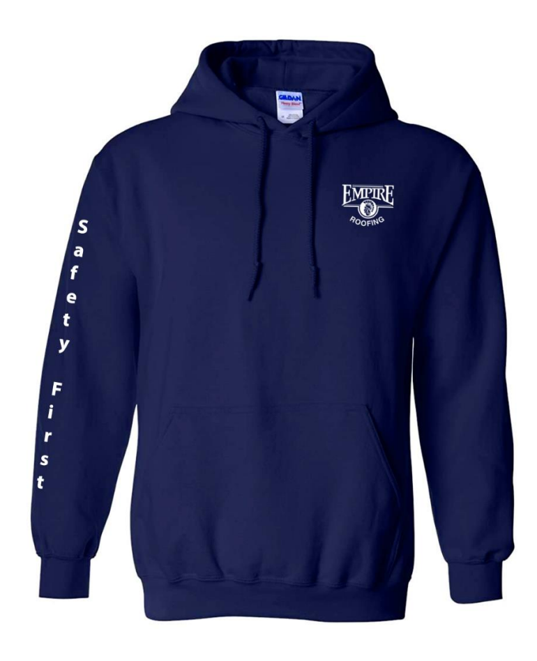
S, M- $14.00 ea. 2X,4X - $16.00 ea.